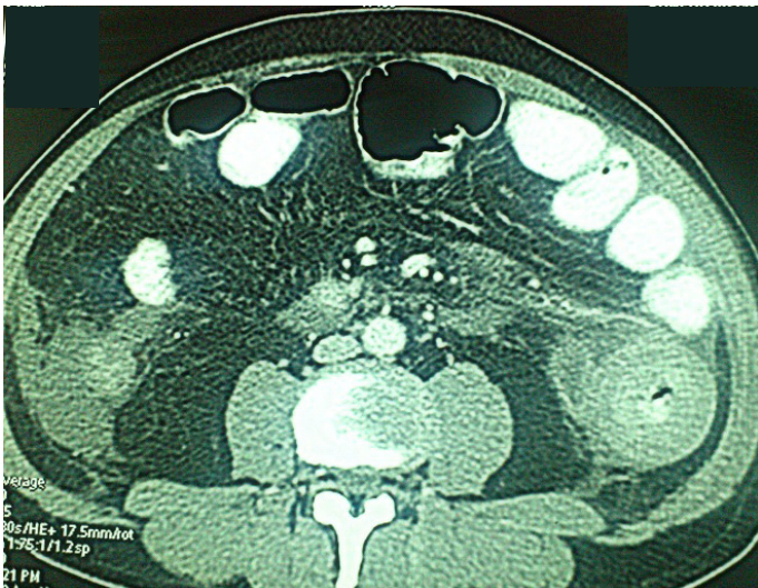
[Table/Fig-2]: Computerised Tomography of abdomen showed circumferential long segment smooth wall thickening seen in the colon. (Axial section, shown with arrows)