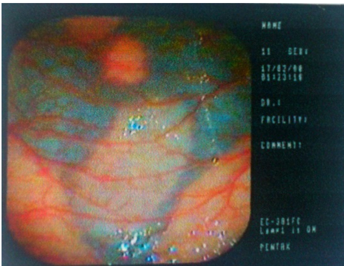
[Table/Fig-3]: Colonoscopy showing multiple submucosal haematoma in the rectosigmoid segment

therapy. Warfarin was stopped and he was monitored continuously, along with Vitamin K injections, every day for five days. The repeat PT was-15.2 seconds (control-13.9 seconds). The intestinal obstruction was completely resolved. After 2 months of follow up, the patient was free from the bowel symptoms and he was restarted on the warfarin therapy (2mg).